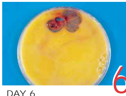
· Appearance of beak.