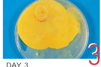
· Heart beats. Blood vessels very visible.