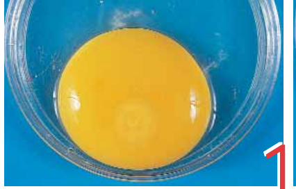
DAY 1 Appearance of tissue development.