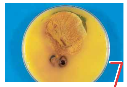
DAY 7 · Comb growth begins.