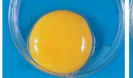
INFERTILE · No development.