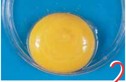
DAY 2 • Tissue development very visible. Appearance of blood vessels.