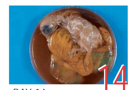
DAY 14 Embryo turns head towards large end of egg.