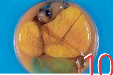
DAY 10 • Egg tooth prominent.