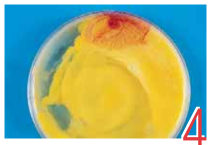
DAY 4 • Eye pigmented.