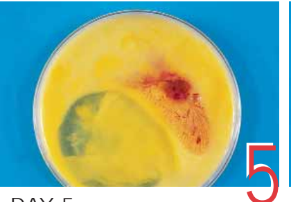
DAY 5 · Appearance of elbows and knees.