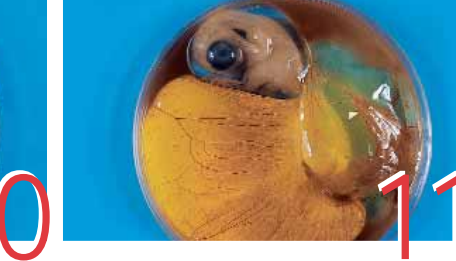
DAY 11 · Comb serrated.